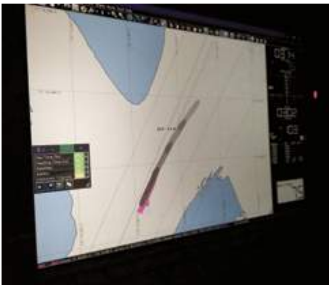
PPU showing GPS smoothing (top) with vessel "lagging" and smoothing removed (bottom)

This type of error has been reported before, but at those times there was no assistance from the Captains involved.