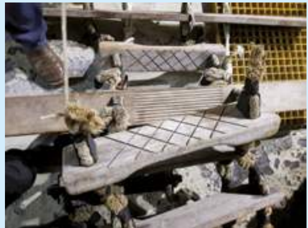
Deathtrap – pilot placed his weight on this ladder prior to disembarking and both side ropes parted!!

Reports being properly actioned so as to prevent a repetition might put an end to situations like the one illustrated below. In this scenario, the pilot actually placed his weight on the ladder and the ropes simply collapsed. Fortunately, this was whilst testing the ladder prior to disembarkation, but had this not been the case then the consequences might have been tragically different.